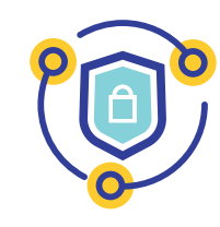
Data and Cyber Security