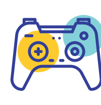
iGaming and Digital Games